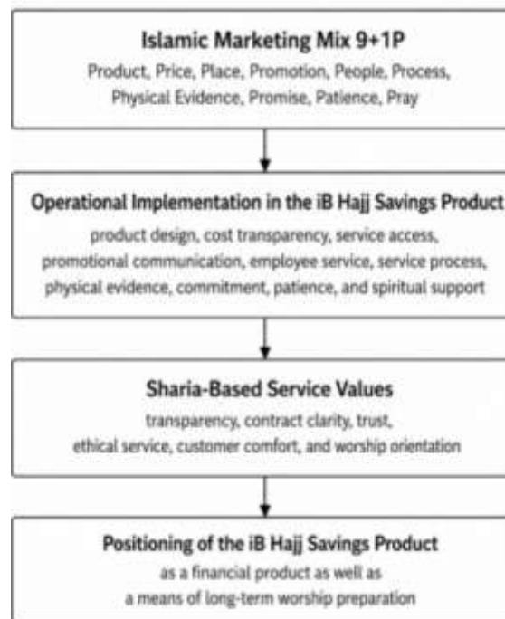
Figure.1 Research Framework

The conceptual framework of this study is built on the assumption that the Islamic Marketing Mix 9+1P serves as a bridge between sharia marketing principles and the operational practice of Islamic banking services. In the context of iB Hajj savings, each element of the 9+1P framework is expected to shape the way the bank designs the product, communicates information, manages service processes, builds customer trust, and internalizes spiritual values. The framework can be described as follows: